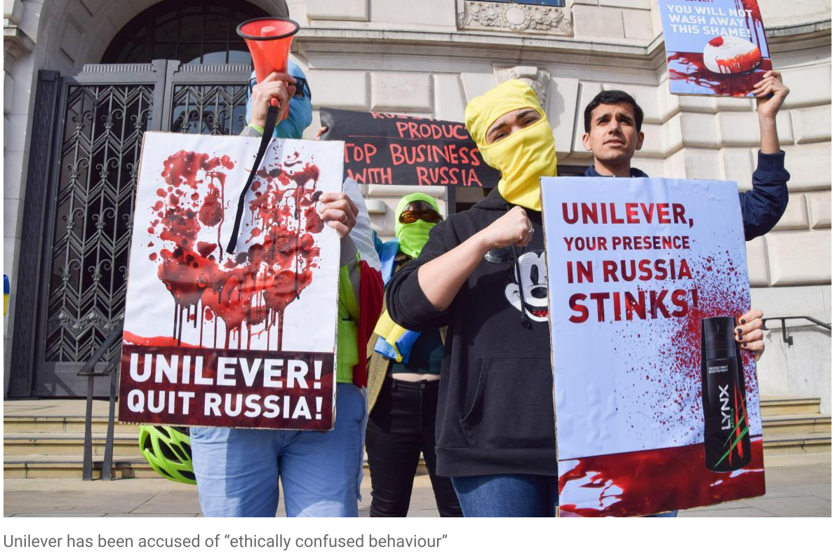
Unilever has been accused of "ethically confused behaviour"