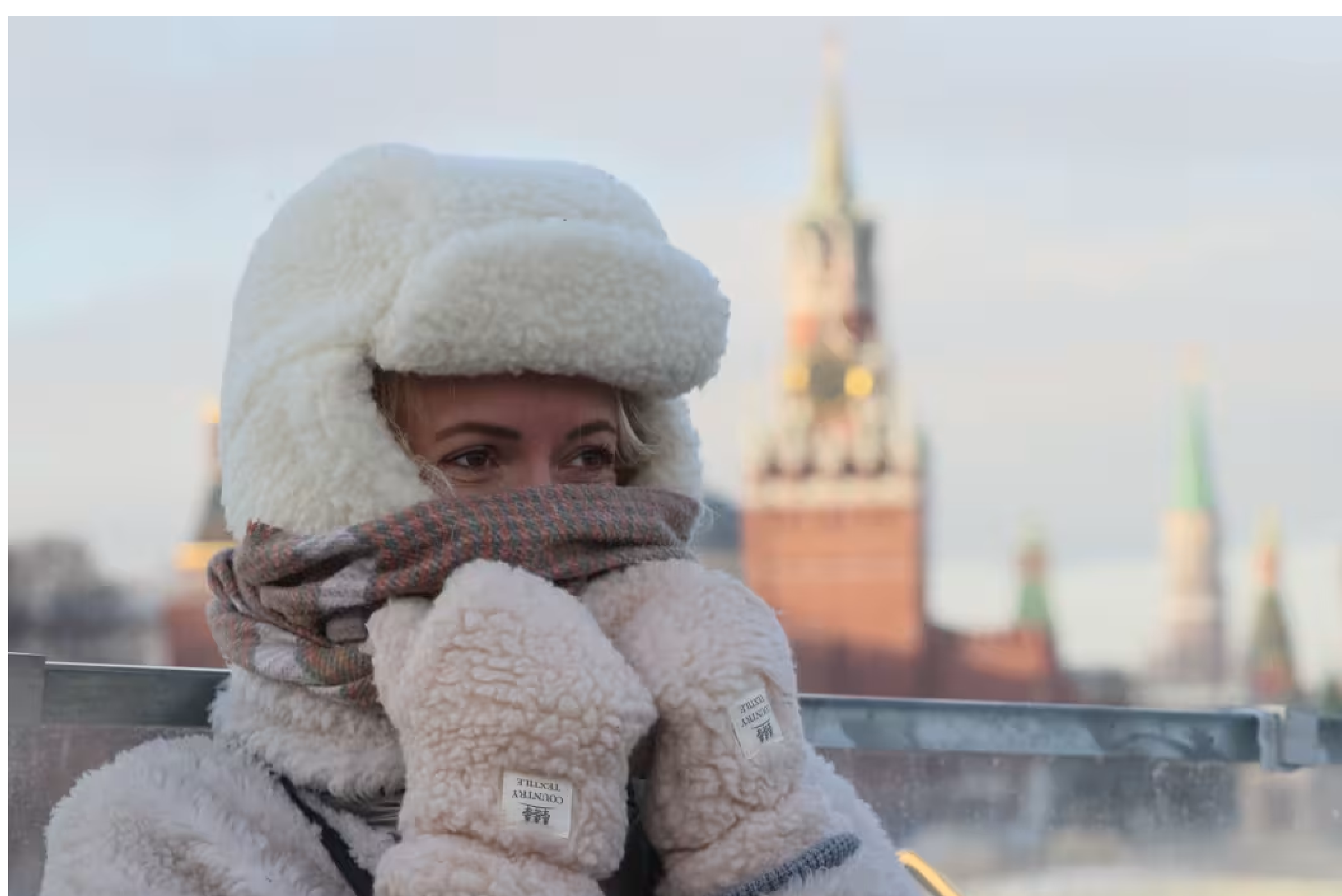
Avon is being slammed by report that it's still operating in Russia after its invasion of Ukraine.

Beauty giant Avon says its Russian operations are 'a critical support' for women in the country